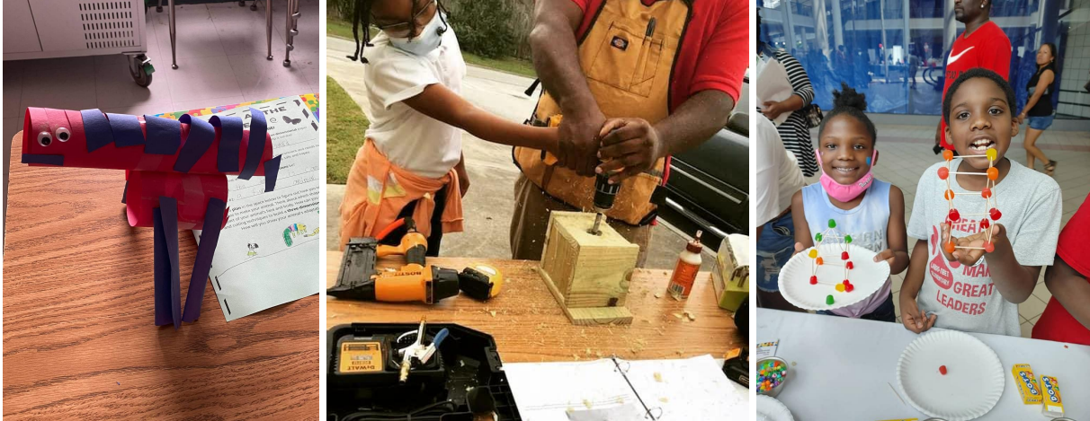
STEAM activities span a wide array of projects, including creating paper creatures, building bird houses, and erecting structures with Dots candy and toothpicks.