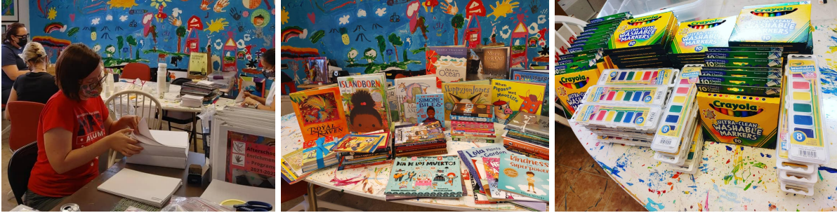
Volunteers help organize and pack program kits throughout the year; and we received many generous supply donations in 2021.