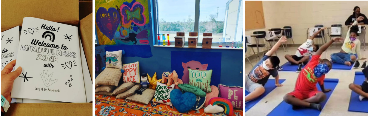
Mindfulness Zone workbooks get unpacked; the Mindfulness Zone room at Gadsden Elementary is ready for students; and Embrace summer camp students enjoy yoga as part of the Mindfulness Zone programming.