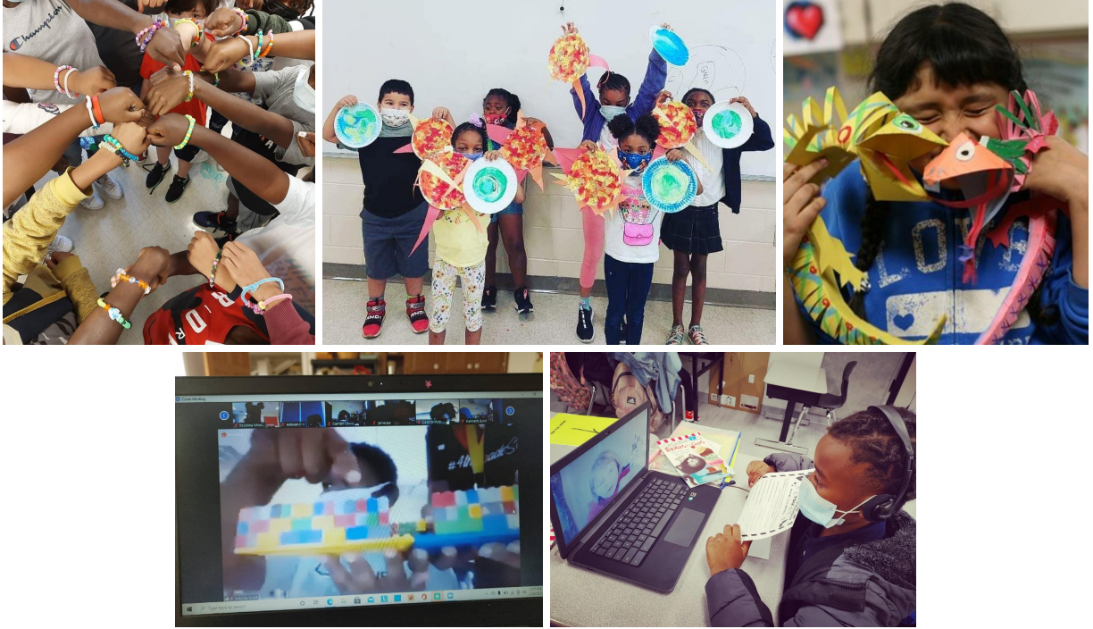
Loop It Up students show off projects and artwork created during Embrace summer camp and STEAM programming.