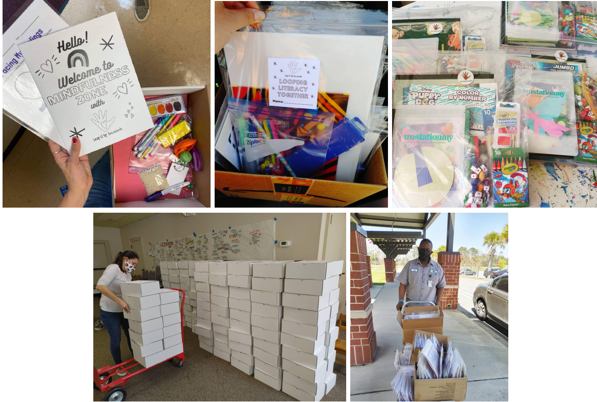
Distance learning kits are packed, delivered, and ready for students!